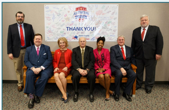
HCDE Board of Trustees

Members of Harris County Department of Education's Board of Trustees were honored by staff and community at the January 26 board meeting and reception as part of School Board Recognition Month. This year's campaign was "All-Star Team."